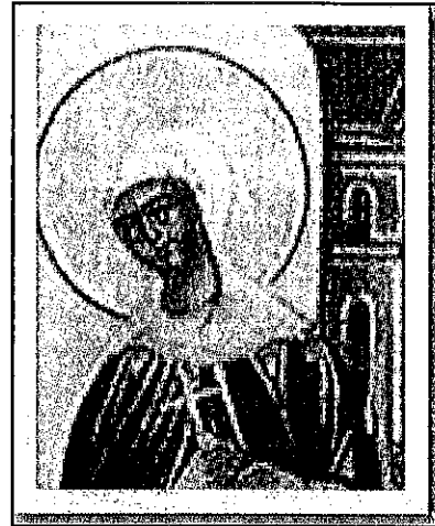
St. Christina of Persia

Sometimes, we can find tons of books about a saint. Think about Saint Constantine. He was an emperor who lived hundreds of years ago. We still know lots about him, what he did for the Church, and what his mother, Saint Helen, did too. We hear stories about other saints, about their lives, wrote they wrote or did, and about miracles they've helped with.