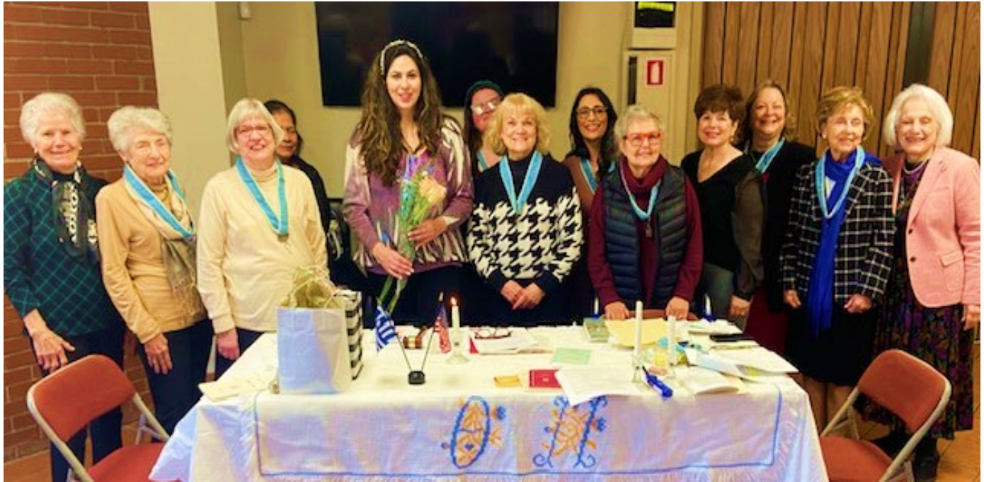
Daughters of Penelope members welcome a new member and Celebrate the Chapter Birthday, February 26 th , 1937.