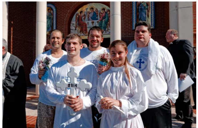
Cross Retrievers and Dover Bearer in front of Holy Trinity Cathedral

This historic anniversary commemorates the First Greek Orthodox Church founded in North and South America 150 years ago. We honor the commitment of Holy Trinity members to maintain their faith and place of worship, while recognizing their contributions to the City of New Orleans and surrounding areas.