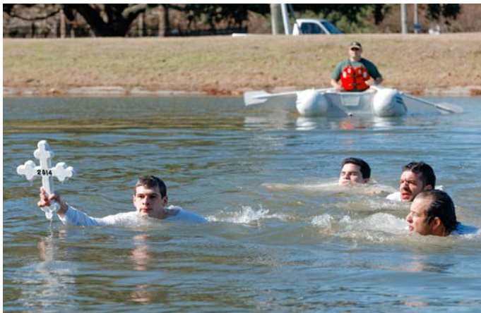
Cross Retrievers in Bayou St. John, January 12, 2014. The one who retrieves the cross receives a special blessing.